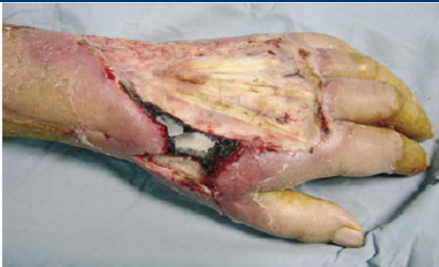
Abb. 1: Zustand nach ausgeprägter nekrotisierender Fasciitis links